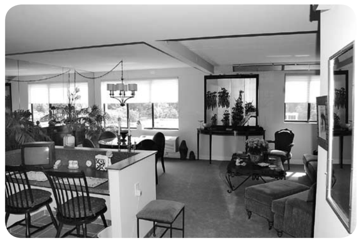
Ample living space, excellent natural sunlight, and added special touches make this large apartment feel like a house.

For more information on the larger suites, call (216) 896-7428.